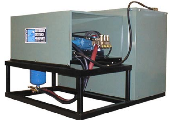
S830K2472AS STANDARD SERIES