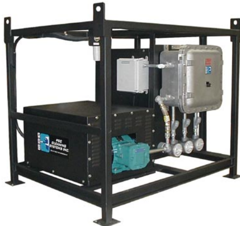
S543K448A-EX1 EXPLOSION-PROOF STANDARD SERIES