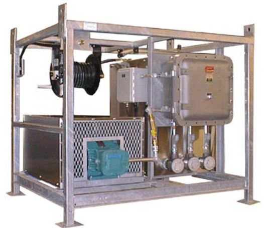
OS429K448AS-EX1 EXPLOSION-PROOF OFF-SHORE SERIES