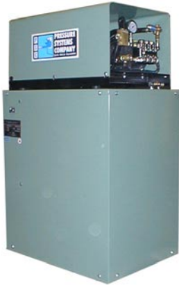
S429K448A STANDARD SERIES