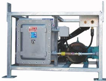
OS420EA3-EX1 OFF-SHORE SERIES