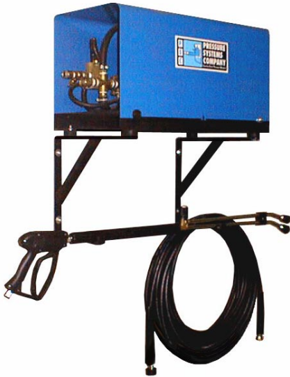
S210EA1 - 2.1 GPM @ 1000 PSI