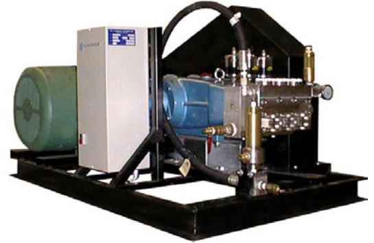
S950EA5-3 - 9 GPM @ 5000 PSI