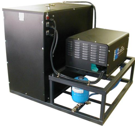
ES830K2472AS - 8 gpm @ 3000 psi with optional SRA surge relief assembly