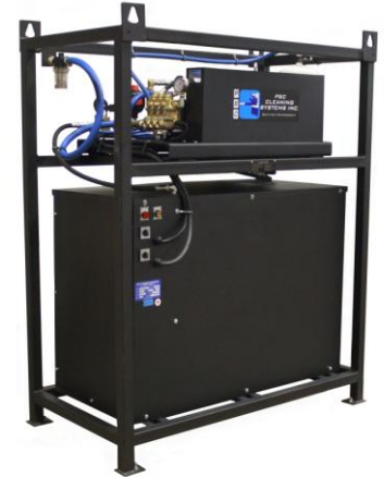
ES650K2496A - 6gpm @ 5000 psi with heavy-duty lifting skid