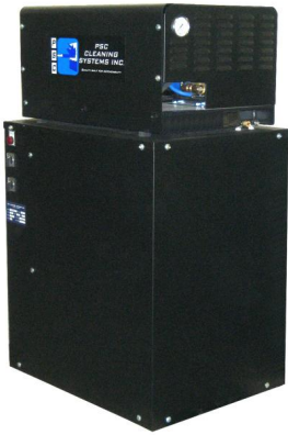
ES543K472A 5.4 gpm @ 3000 psi max.