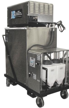
ES543K472AS - 5.4 gpm @ 3000 psi with optional stainless steel wrap, cart and dual chemical system